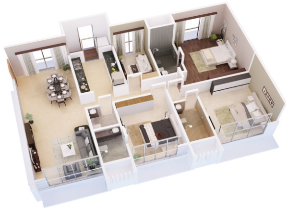
3.5 BHK LAYOUT